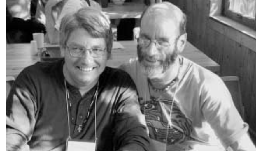
Photography by Ramón Noya